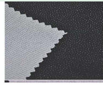
Non Stretch Tricot Fusible Interlining