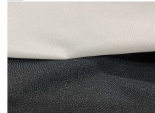
Water Jet Interlining