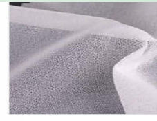
Stretch Tricot Fusible Interlining