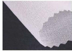
100% Cotton Heavy Weight Interlining